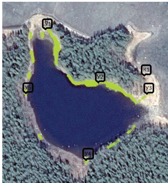
Figure 2: Distribution of Ophioglossum vulgatum L. around Kislo-Sladkoye lake (populations shown in lime green). Stations where abiotic factor were measured are shown (Table 1).