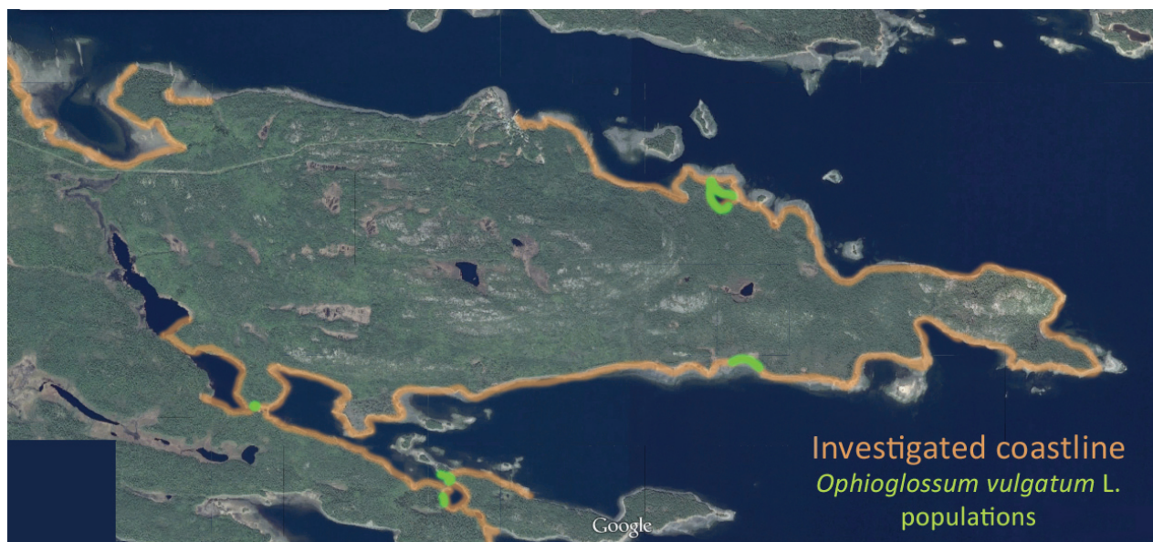
Figure 3: WSBS vicinity satellite map (maps.google.com). A stretch of 16.5 km of the White Sea coastline was examined from Ermolinskaya Guba to Zeleny (Green) Cape (shown in orange). Ophioglossum populations are shown in lime green.

Abiotic factors of Adder's tongue growth were proposed (Figure 4).